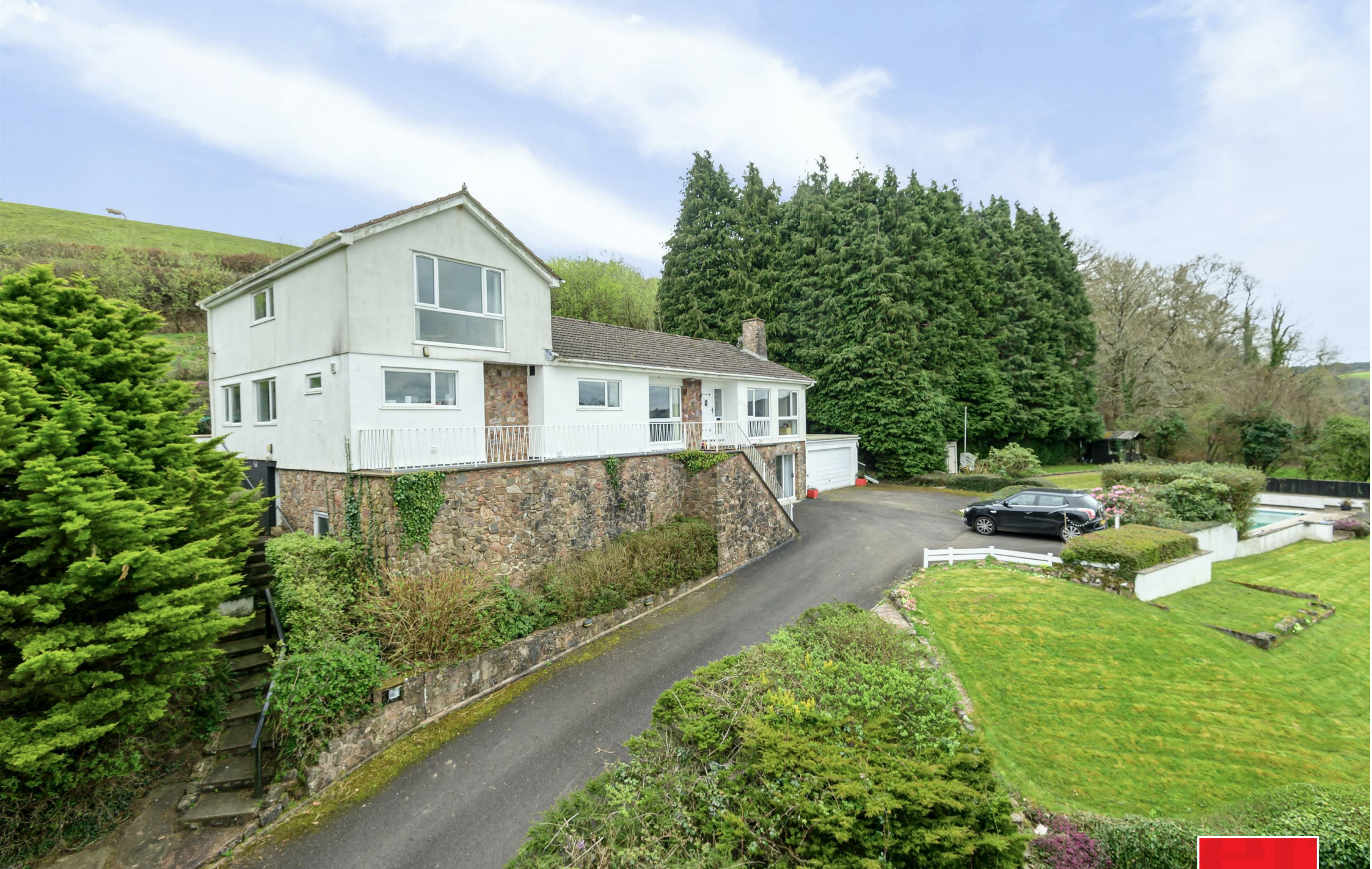
Highfield Maundown, Wiveliscombe, Taunton, Somerset, TA4 2BU